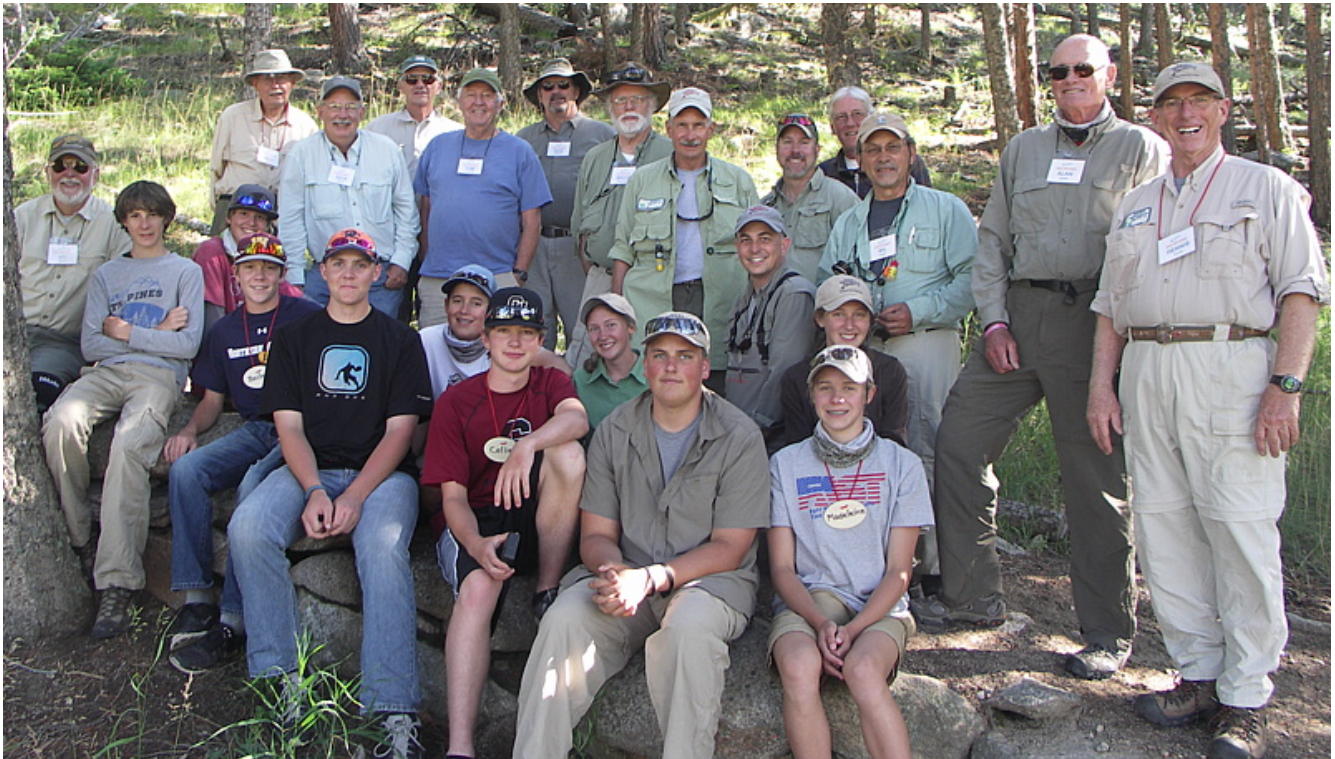
2014 Rocky Mountain Flycasters Day Campers and Their Mentors after Fishing Cub Creek in Rocky Mountain National Park

Despite being rain-stormed out of our Tuesday pond casting exercise, Old Man Weather didn't daunt spirits of this year's campers. Wednesday, also a rainy stormy day you may recall, was our full day fishing the Poudre high in the canyon, and the rain was virtually continuous there - fortunately without lightening. Our intrepid campers' spirit shone that day as they had a successful collective catch experience, mostly on dry flies. This year's camp group was a bit smaller than usual, but its enthusiasm, interest and character were superior.