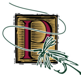
St. Peter's Fly Shop