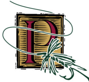
St. Peter's Fly Shop