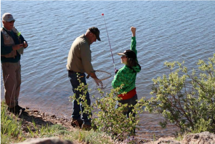
First fish of the day at US Forest Service's Kids Free Fishing Day!