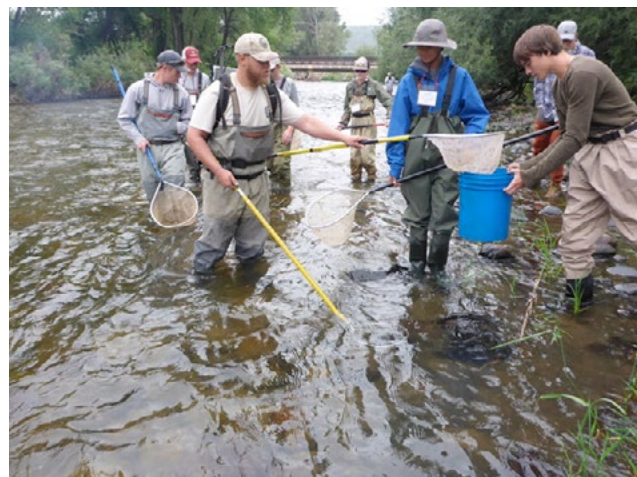
Sampling fish on the Poudre River

cutting back invasive weeds under the supervision of Wildlands Restoration Volunteers. Of course, they've caught lots of fish too! I enjoyed fishing with different campers and seeing their technique and skills improve through the week. I don't have enough room here to list all the activities but suffice it say, we've all been very busy.