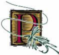
St. Peter's Fly Shop