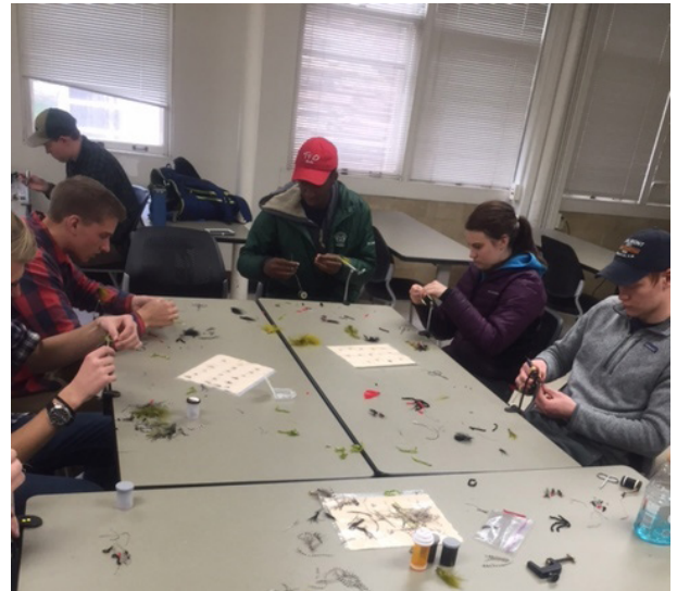
CSU 5 Rivers Fishing Club tying flies

The new CSU 5 Rivers Fly Fishing Club members are busy! In mid March the leaders and core members held an informal gathering to plan how to begin recruitment for mere members. On April 6th the club held it's first official members meeting - attended by 38 students - and the following weekend five including two leaders attended the Western Regional 5 Rivers Clubs Rally held at Meredith, CO, mixing with students from other colleges and learning many program ideas and “how to’s” to implement next fall when CSU returns to campus. The local leadership has already launched two Casting & Fly Fishing Basics classes and two Fly Tying classes. Finals are the week of May 9th and this semester ends on the 13th. Leaders are already beginning to make recruitment and programming plans for when students return next August 16th, so the new club can get off to a fast start.