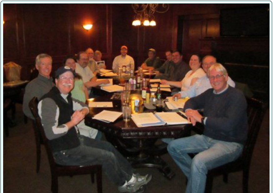
RMF Board meeting in progress