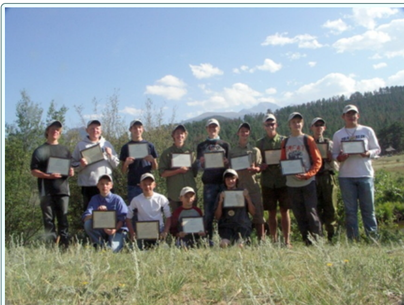
2012 Day Camp Attendees Receive Completion Certificates

The applications are pouring in so if you know any kids between the ages 14-18, boy or girl, please encourage them to download the Application & Parents Information packet available at the following link. Rocky Mountain FlyCasters Day Camp Application