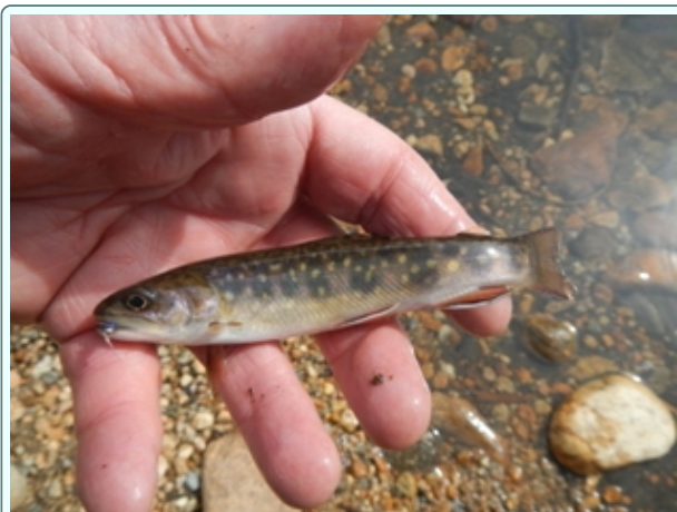
RMNP Meadows Brown

Friday morning, April 13th, the sun rose fairly bright and welcomed seven intrepid chapter anglers who gathered at the Loveland K-Mart parking lot. The weather looked really nice despite forecasts that a major front was to move in later that evening. We jumped into our cars and drove straight to the Fern Lake trailhead at the far end of RMNP's Moraine Park. Occasional charred grass spots were visible as we drove along the valley bottom, and when we reached the trailhead all of the familiar, dense willows were either completely burned off or remained only as sparse, black branches.